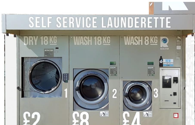
Photo-Me International Shakes Up Market with Revolution Technology